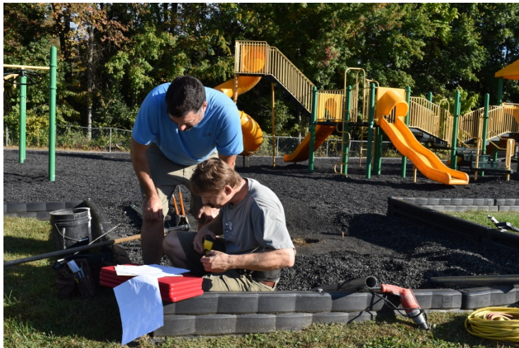
The See-Saws will be ready soon!